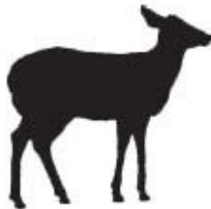
Young Deer Silhouette