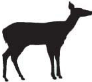
Mature Doe Silhouette